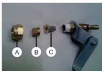
A: cap, B: spray tip, C: check ball valve filter