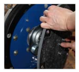
Fig. 34 Fig. 35 Fig. 36

IMPORTANT SAFETY INSTRUCTION: Tighten the screws sufficiently to avoid disengagement of the driver plate from the machine base during operation.