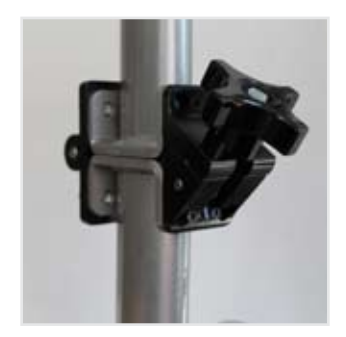
Fig. 3 Fig. 4